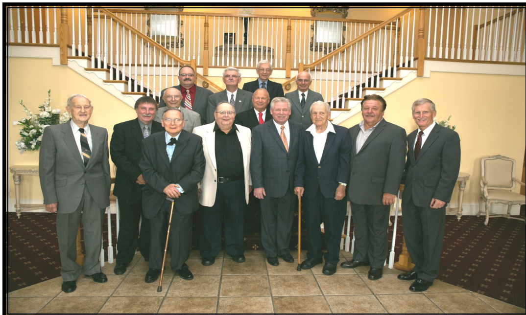
2014 PACC Officers and Board Members